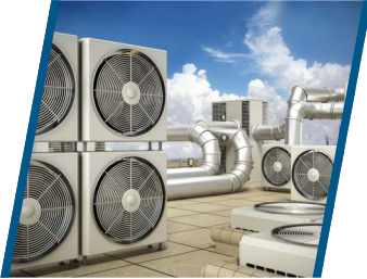
Suitable for HVAC System

Shakti's Nandi Universal Drive is a unique product designed, developed and manufactured in India. This drive makes it possible to run solar and industrial motor pump sets. It supports wide varieties of motors by virtue of its universal design. It's IP 65* design and rust-proof metallic enclosure provides protection from foreign particles (e.g. rain, dust, oil) which obsoletes the need for extra outer case.