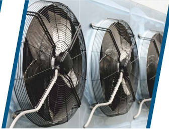
Suitable for Industrial Fan