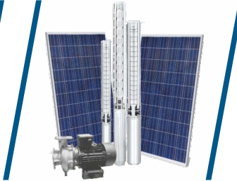
Suitable for Solar Pump