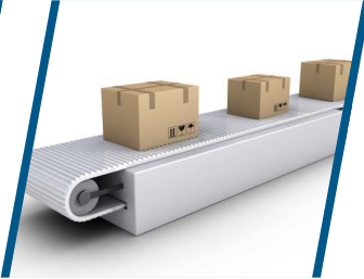
Suitable for Conveyor Belt